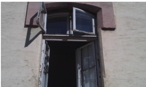
Left: Previous state – windows in bad repair Below: Our team at work